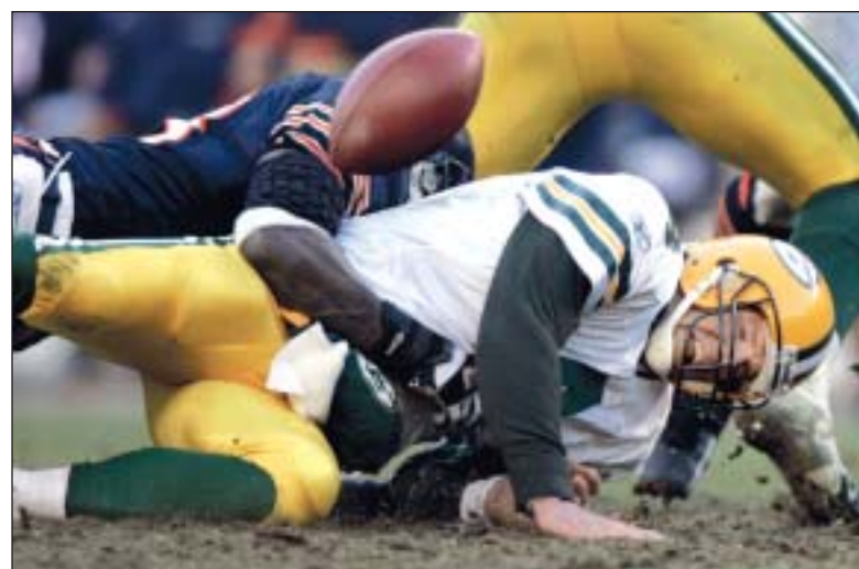
Green Bay quarterback Brett Favre loses the ball after being sacked by Chicago Bears defensive back Charles Tillman in the fourth quarter of the Bears' 19-7 victory at Soldier Field on Sunday. More coverage on Page 1D.