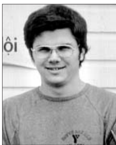
Mark David Chapman, seen here in a 1975 photo, shot and killed John Lennon outside Lennon's New York home on Dec. 8, 1980.