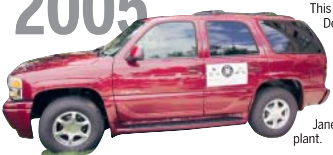
This 2005 GMC Denali represents the 16 millionth car off the production line at Janesville's GM plant.