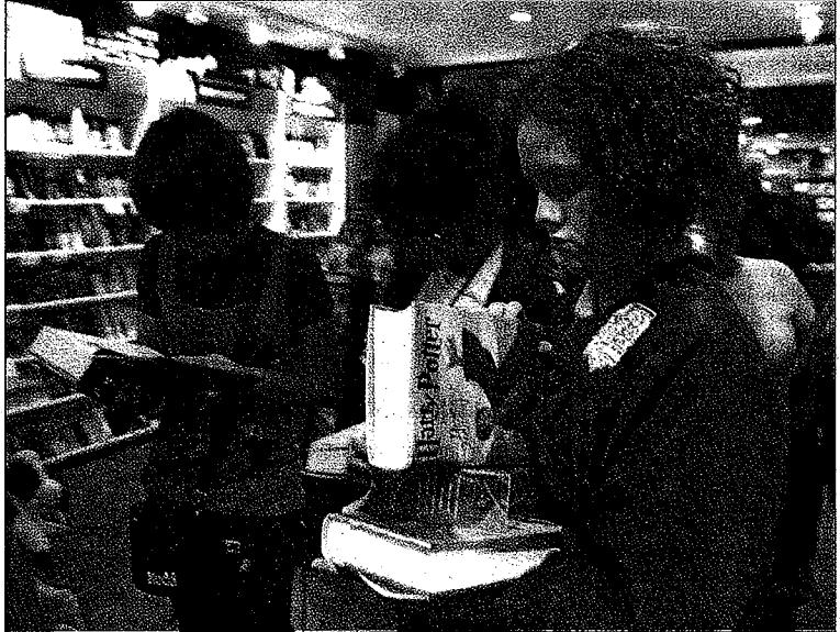
NOW

waiting for the release of "Harry Potter and the Deathly Hallows"